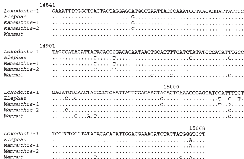
FIG. 1. Aligned DNA sequences of a 228-bp fragment of cytochrome b from extant ( Loxodonta africana and Elephas maximus ) and extinct ( Mammuthus primigenius and Mammuthus americanum ) proboscideans. Specimen numbers follow the description in the text. Dots represent identical bases to Loxodonta -1, and ? represents one unresolved base. The codon numbering follows the Homo sapiens system (28).

Initially samples were analyzed under a blind testing design, in which the taxonomic identities of the samples were known only to one of the authors (J.S.), who was not performing the laboratory analysis. Duplicate samples from the same animal and samples from different individuals of the same species were provided with only sample numbers. Correct identifications of contemporary species and duplicates were achieved when sequences determined in the laboratory were compared with previously published data. Fossil sequences were similar but not identical to the two modern sequences, demonstrating the robustness and cleanliness of the laboratory procedure.