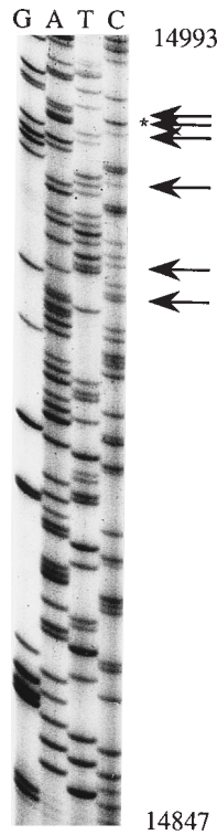
FIG. 2. Autoradiograph of a segment of the cytochrome b gene from Mammuthus americanum , the extinct American mastodon. Arrows indicate variable sites relative to the Loxodonta -1 sequence, and the asterisk identifies the unique first position nonsynonymous substitution. The numbers refer to the homologous human position (28).

Phylogenetic Analyses. Phylogenetic analyses were performed using maximum parsimony with exhaustive search and equal character weighting (27) and by neighbor-joining analysis using two-parameter sequence distance estimates with a 10:1 transition to transversion ratio (28, 29).